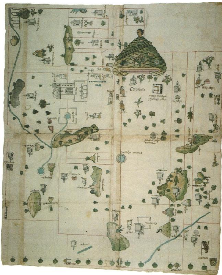
Illustration 5. The 'Relación Geográfica' map of Cempoala, 1580. Cempoala was the expeditions first ally against the Aztecs. Cortés returned here from Tenochtitlan in May 1520 to defeat the rival Spanish expedition sent to arrest him by the governor of Cuba, Diego Velázquez. Cempoala nowadays is a relatively unknown but well maintained archeological site where many ruins related to the early years of conquest can be seen. This map is the result of a survey, commissioned by king Philip II, asking for local maps and descriptions of places. Many maps, like this one, were painted by indigenous artists. A large glyph depicts the indigenous place name of Cempoala; to the left is the local Franciscan monastery. The landscape is thickly sown with indigenous toponyms and images of native leaders. (source: B.E. Mundy, The mapping of New Spain; indigenous cartography and the maps of the Relaciones Geográficas , 1996)