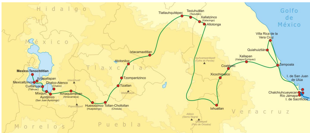
Illustration 2. 'La Ruta Cortés' overland, between San Juan de Ulúa (Veracruz) and Tenochtitlan (Mexico City)