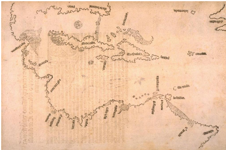
Illustration 1. The West Indies as they were known when Cortés arrived. This is the first printed map to show the actual geographical outline of the West Indies, as Columbus mapped it out in 1492-1503. It was published in Sevilla by Pietro Martire d'Anghiera (Peter Martyr) in the 1511 edition of his "Decades" (Opera, Legatio, Babylonica, Oceanidecas, Paemata, Epigrammata). His publications included the first historical account of the Spanish discoveries. In his work he suggested that Columbus had in fact reached a "New World" rather than "the Indies".